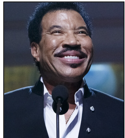
Lionel Richie, 2022

Songs that combine multiple genres are often called "crossover hits" because they connect with audiences across different musical styles.