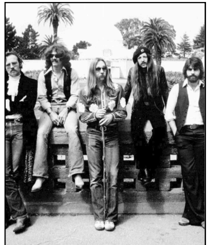
Image Credit: Photo of The Doobie Brothers (1977), Warner/Reprise Records, Public domain, via Wikimedia Common

Tell someone about a song that always makes you feel good.