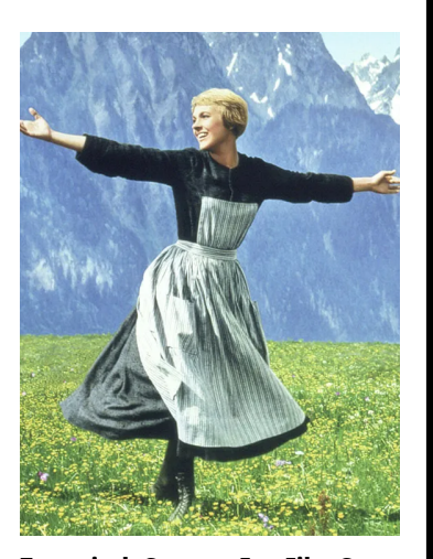
Twentieth Century Fox Film Corp.

This month, we honor the 60th anniversary of the beloved film The Sound of Music by singing and moving to songs that have inspired generations. First released in 1965, the film's unforgettable melodies and heartfelt story continue to resonate around the world 60 years later. Join us in reflecting on the enduring impact of this classic musical and experience the joy, nostalgia, and connection that its songs continue to bring.