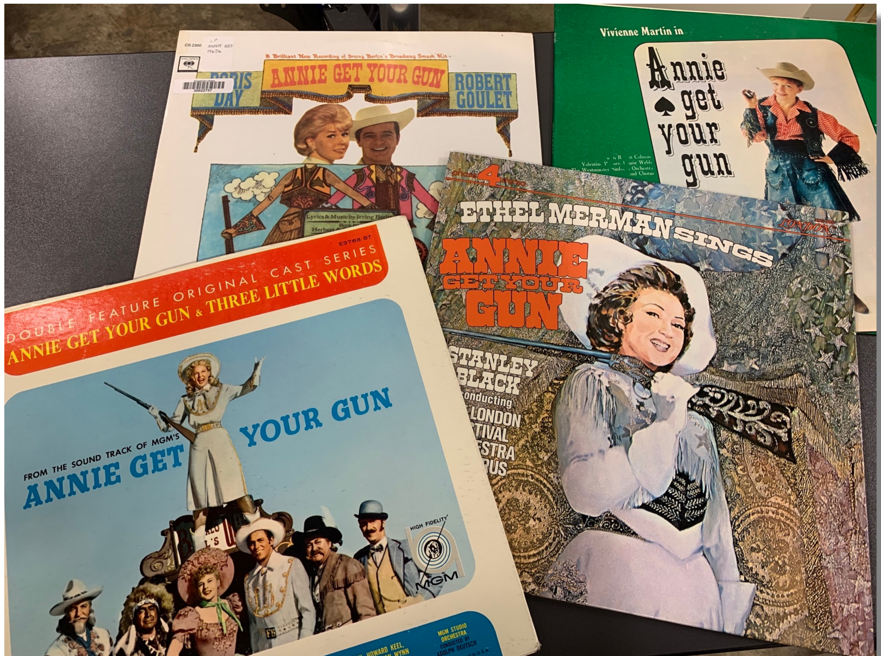
“Annie Get Your Gun” LP records from the Songbook Library & Archives.