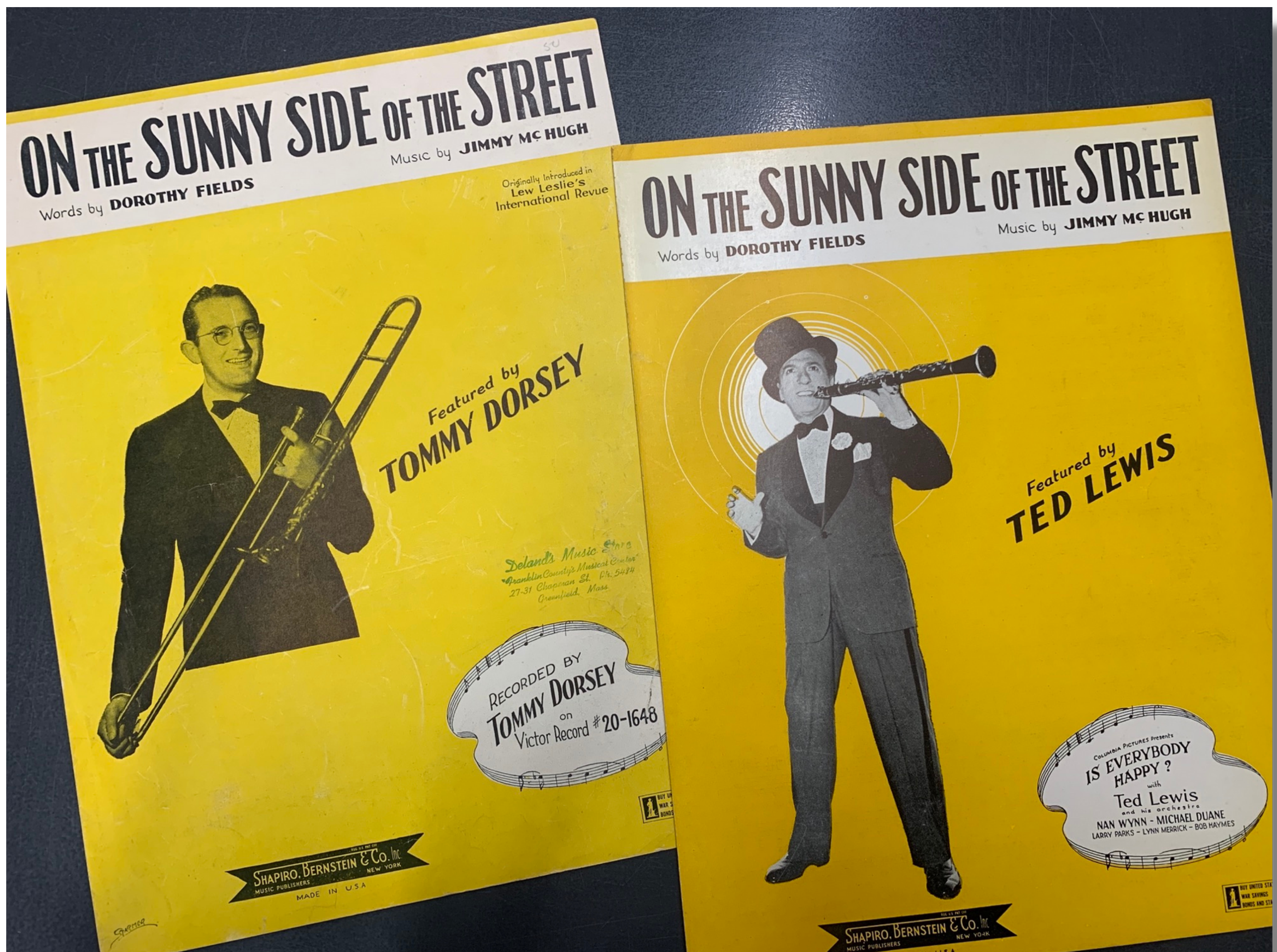
"On The Sunny Side of the Street" sheet music, Robert Grimes Collection, from the Songbook Library & Archives.