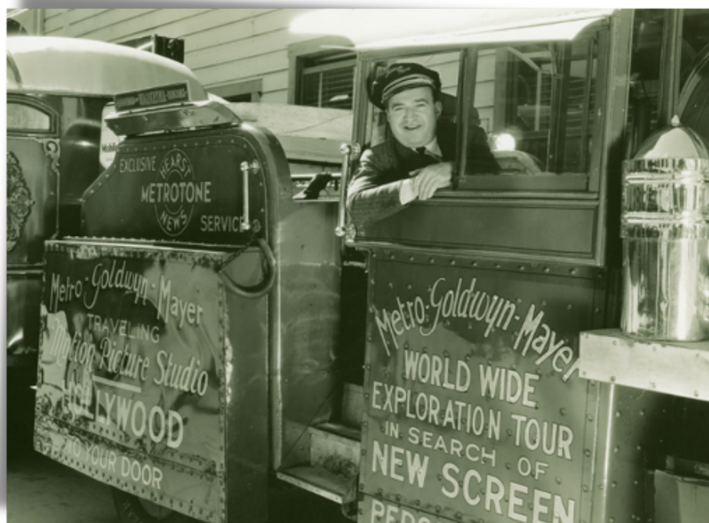
Lyricist Gus Kahn riding the MGM train.

Classic movies like Casablanca feature music that is just as recognizable as iconic lines like, "Here's lookin' at you, kid." Whether you love movie musicals like Grease or beloved cinema standards, you'll be ready to say "lights, camera, action" with this month's Perfect Harmony® packet and videos.