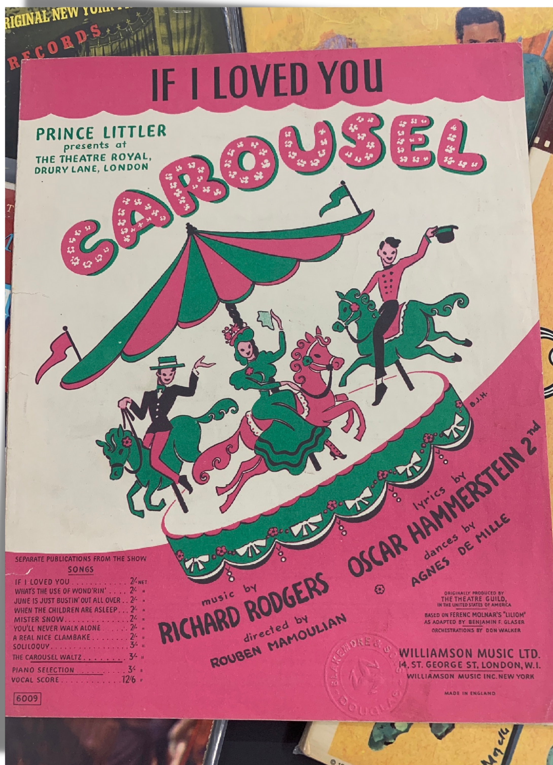
Cover art on the published sheet music of "If I Loved You" from Rodgers & Hammerstein's Carousel.