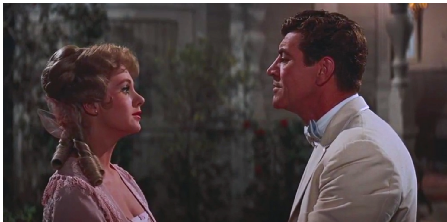
Shirley Jones (Marian Paroo) and Robert Preston (Harold Hill) in the 1964 film The Music Man .

Meredith Willson's musical The Music Man features one of the most enchanting love songs, "Till There Was You." This tune crossed over into the pop music sphere more than once, as it was recorded by numerous artists, including Doris Day who wrote to Meredith that it "must be my favorite song in the whole world." See the letter housed in the Songbook Library & Archives on the next page or enjoy a bonus Perfect Harmony listening activity featuring this timeless love song.