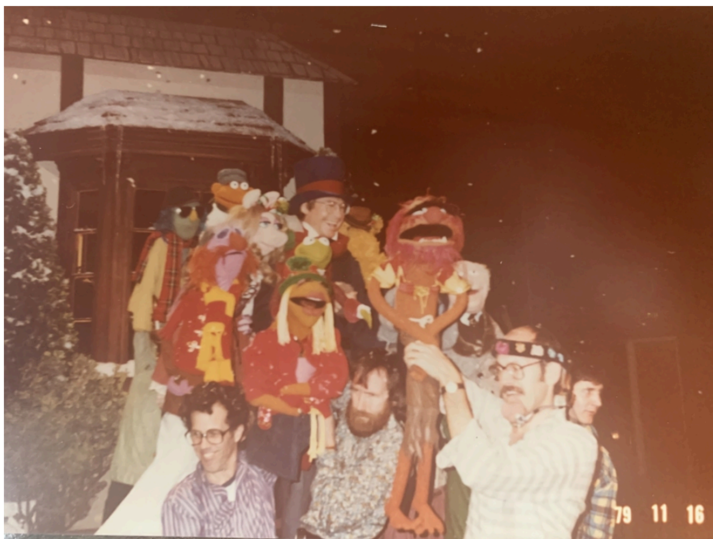
John Denver in the top center between his Muppet friends including Miss Piggy and Animal. Jim Henson (creator of the Muppets) is shown bottom center.