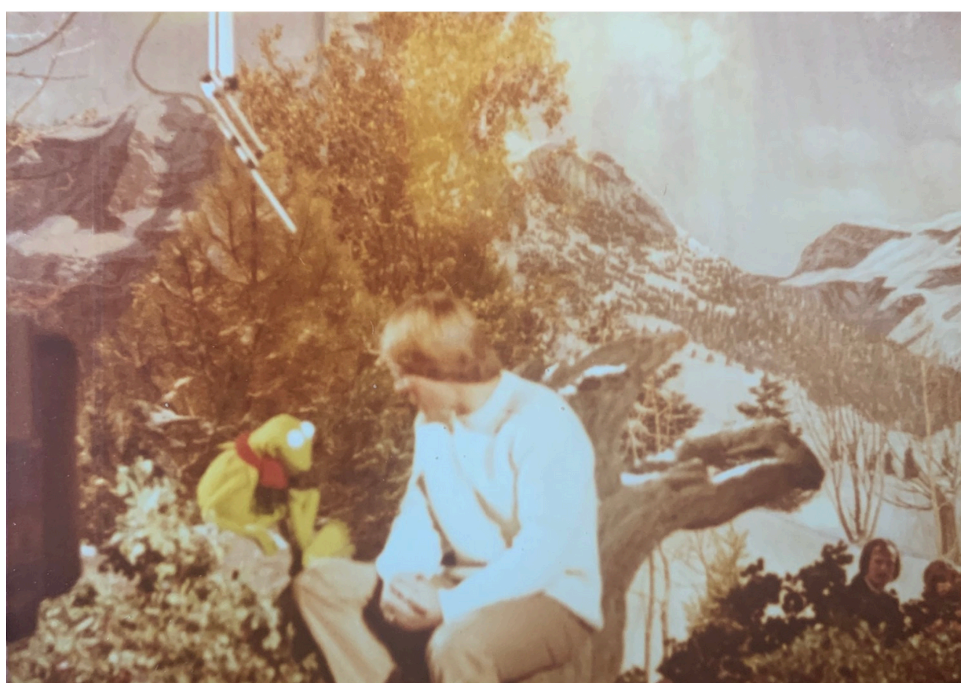
John Denver recording "The Christmas Wish" with Kermit the Frog.